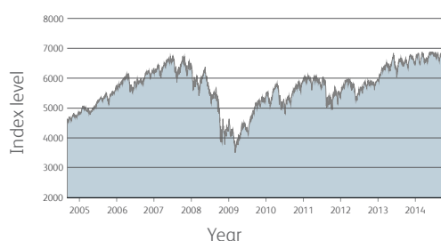
FTSE 100 Index