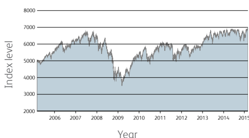
FTSE 100 Index