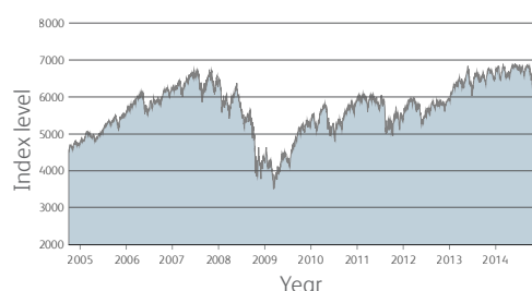
FTSE 100 Index