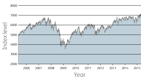
FTSE 100 Index