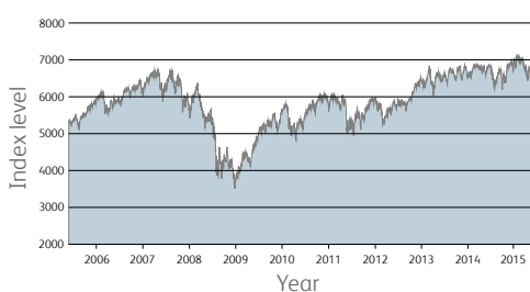
FTSE 100 Index