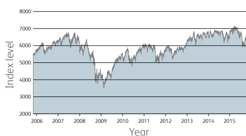
FTSE 100 Index