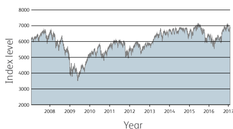
FTSE 100 Index