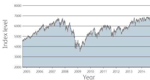
FTSE 100 Index