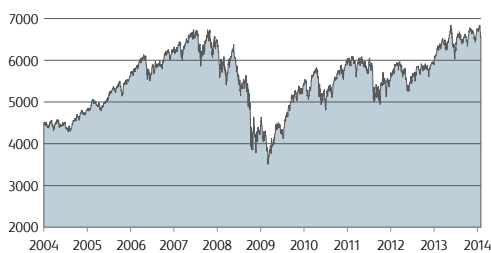
FTSE™ 100 Index