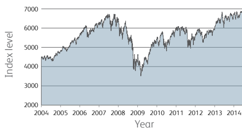
FTSE 100 Index