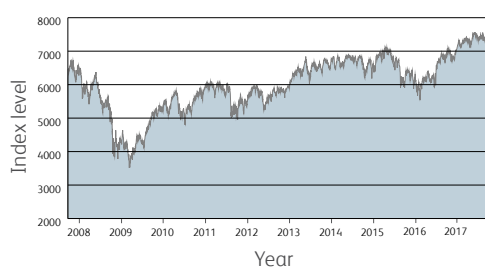
FTSE 100 Index