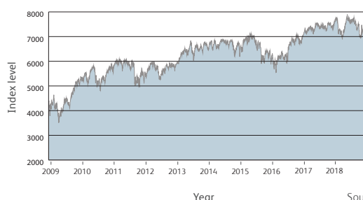
FTSE 100 Index